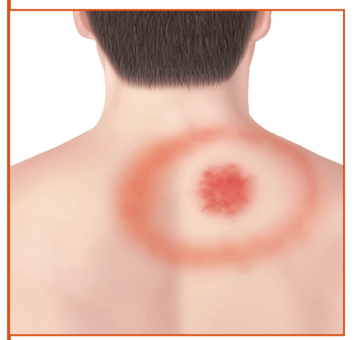
Bull's eye rash on the back.